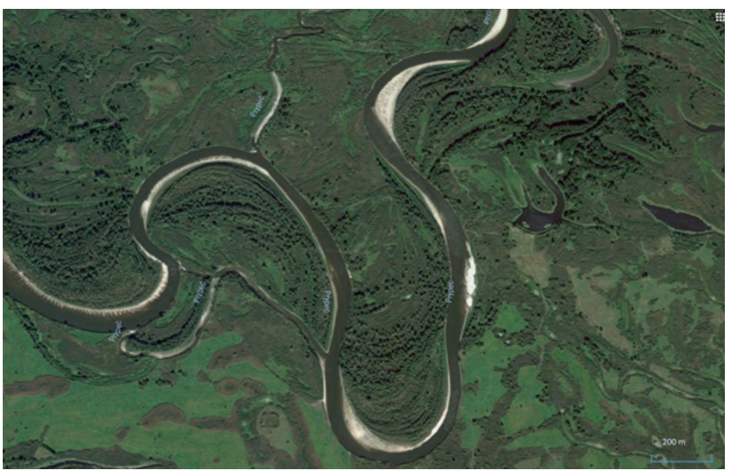
Figure 2: Overview of meanders of the Pripyat river in Pripyatsky National Park