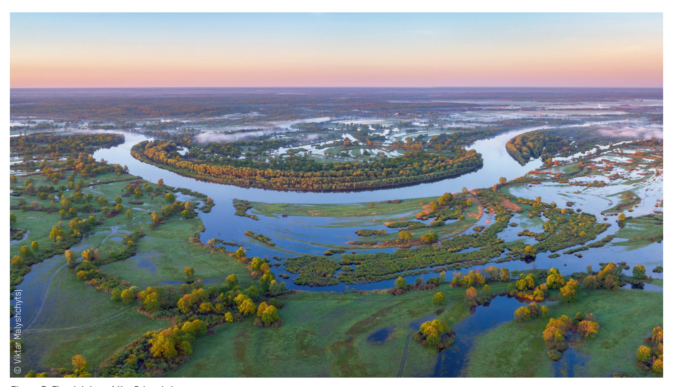
Figure 3: Floodplains of the Pripyat river

Construction of the E40 waterway would involve channelisation and straightening of meanders on the Pripyat river. This would cause irreversible damage to the heart of the Polesia. During spring floods, the middle stretch of the Pripyat river transforms into a huge lake up to 10 km wide and almost 200 km long – bearing a strong resemblance to the Amazon basin. Part of this meandering section lies in Pripyatsky National Park (see figure 3).